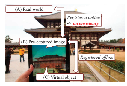
Figure 1: Registration problems in IAR. Inconsistency between the real world (A) and pre-captured images (B) appears due to illumination change (the real world is cloudy; while the IAR scene is sunny).

The proposed IAR system is divided into online and offline processes along with usual IAR systems. Unlike the ordinary IAR, in the offline process, omnidirectional images are captured under various illumination conditions at the same position. Virtual objects are then superimposed onto omnidirectional images and stored into a database with corresponding sub-image histograms. In the online process, a pre-generated augmented image, whose illumination condition is the most similar to that of the real scene acquired by a