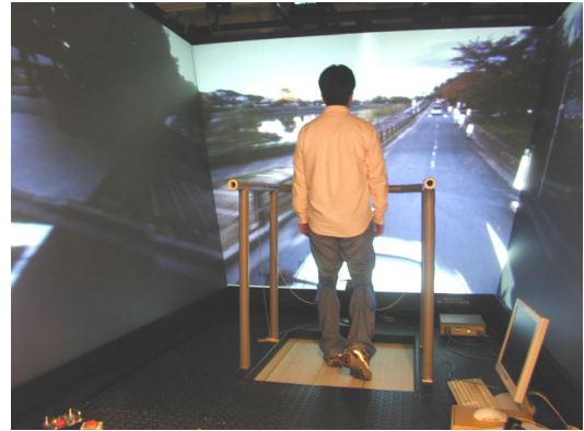
Figure 2. Appearance of telepresence system.

We have confirmed that the proposed telepresence system provides us with the feeling of rich presence in remote sites in this experiment. We have also confirmed that geometric discontinuity between regions projected by different projectors and synchronization error could not be recognized. However, some image discontinuities were observed in scene areas very close to the camera system due to its violation of single view point constraint and poor presence was felt due to the limitation of user's motion. We also felt unnatural in the control of the treadmill when a user begins to walk, because the motion of upper part of the body is not considered in motion