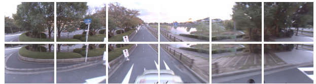
Figure 3. A frame of input movie.

measurement; that is, the displayed image is not synchronized with head motion but with leg motion.